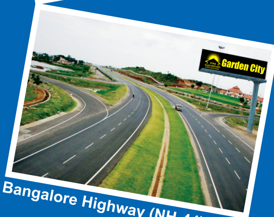
Bangalore Highway (NH-44)