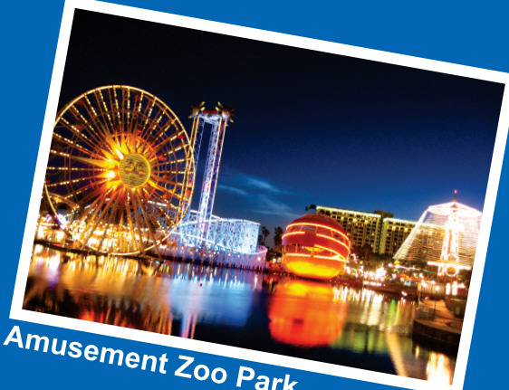
Amusement Zoo Park