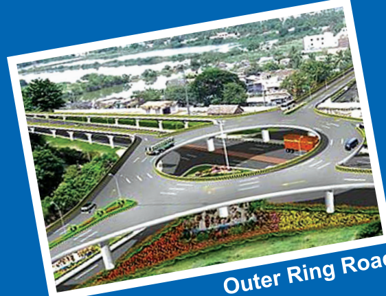
Outer Ring Road